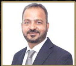
CO-FOUNDER & SENIOR PROPERTY CONSULTANT